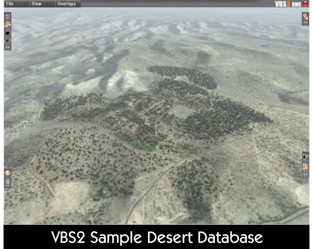
VBS2 Sample Desert Database