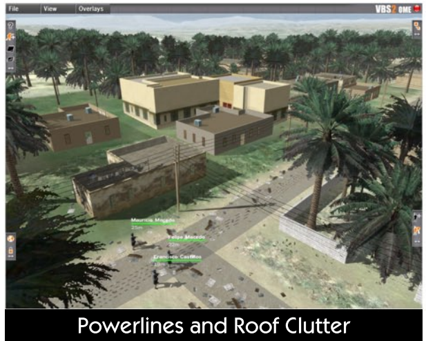
Powerlines and Roof Clutter