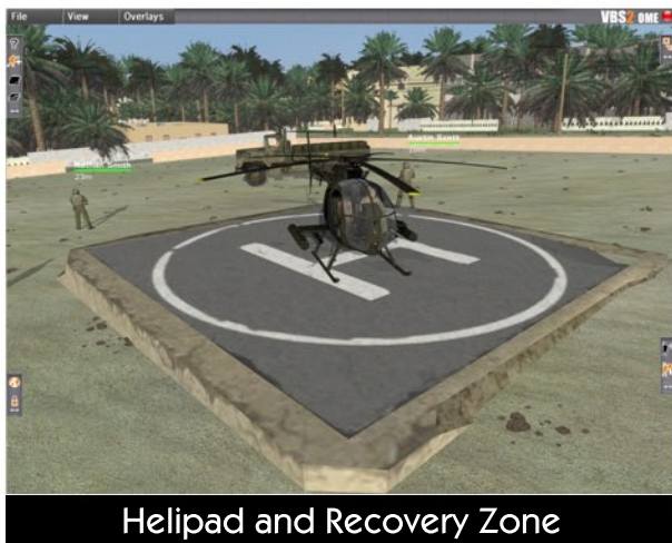
Helipad and Recovery Zone