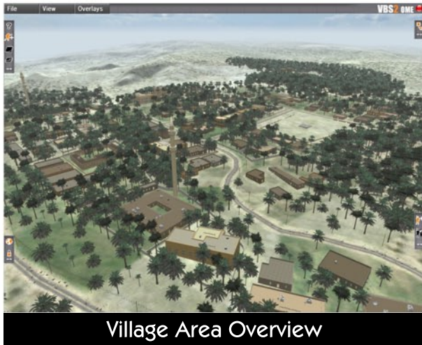
Village Area Overview