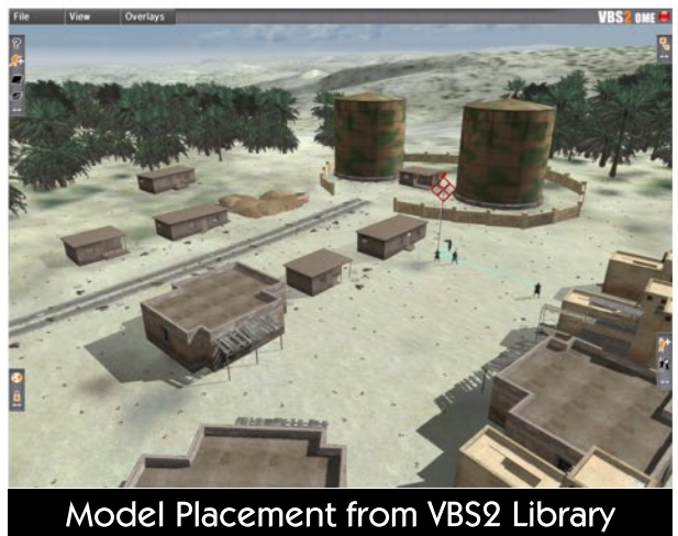
Model Placement from VBS2 Library